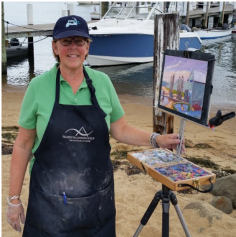
By Betsy Payne Cook

On Sept. 9th, the start of the weekend, meet at the Cape Cod Art Center, 3480 Route 6A, Barnstable, MA